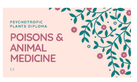
Poisons & Animal Medicine