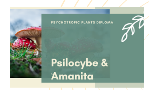
Psilocybe & Amanita