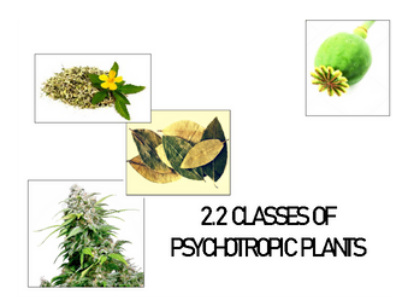
Classes of Psychotropic Plants