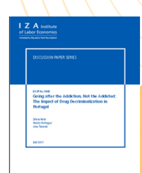
Europe & Psychedelics