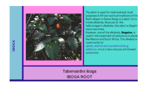
Plants of Africa/Asia/Oceania