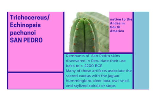
Plants of Central/South America