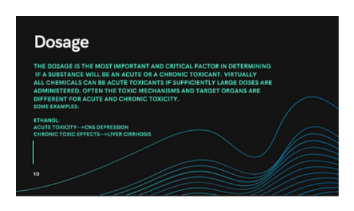
Notes on Dosage