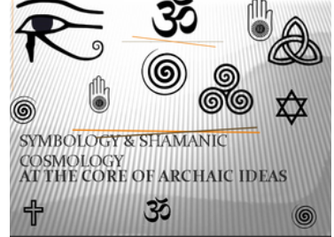
Symbology & Shamanic Cosmology