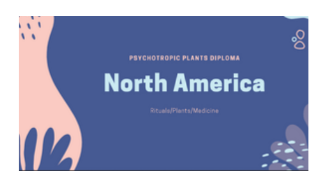
Plants of North America